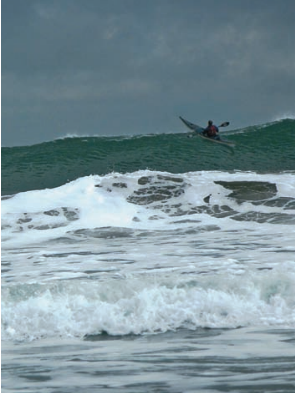
PLATE XXIII Paddler about to disappear.