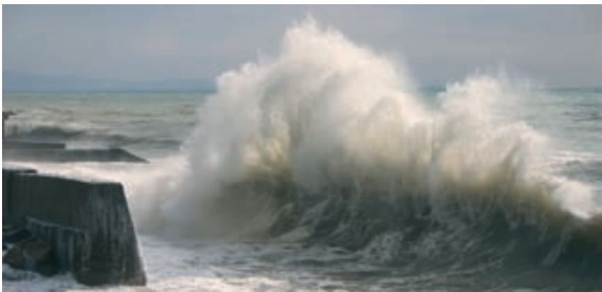
fig. 15.1 Reflected waves can cause explosive clapotis.

So the reflected waves will interpolate with the incoming waves in a largely predictable and regular pattern (an interference pattern) causing an area of disturbed water where wave heights spike (this can be quite explosive) – expect to find this ‘clapotis’ anywhere there is a sheer coastline or harbour wall. A headland bluff that is in the path of a swell is probably best given a wide berth. There will however, be a null point quite close to the rock where the water is less chaotic and almost calm compared with the sea around you.