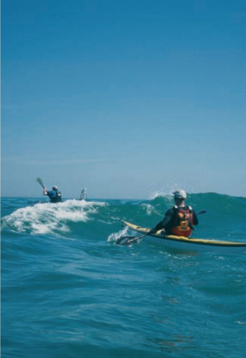
PLATE XXIV Ensure adequate space between paddlers in swell conditions.