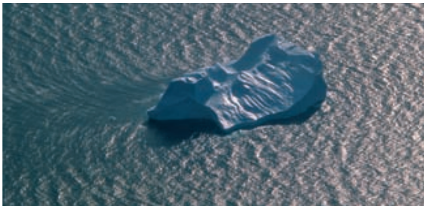
fig. 15.3 Wave diffraction around an iceberg, creating a regular interference pattern.